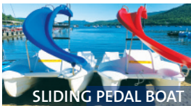
SLIDING PEDAL BOAT