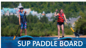
SUP PADDLE BOARD